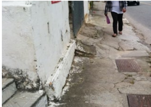
Figure 5 – A sidewalk in poor condition is not perceived as an obstacle to walking by a person who has no disabilities, but for those who do, it can be an impediment.

One can understand the relationship between the perception of affordances and the street with the following example: a person who does not have disabilities does not see a broken sidewalk as an impediment to walk, but a person who needs a wheelchair to move around may notice this same sidewalk as an obstacle (Figure 5). Thus, the walking affordance that the sidewalk has is there, but the two people will perceive it differently.