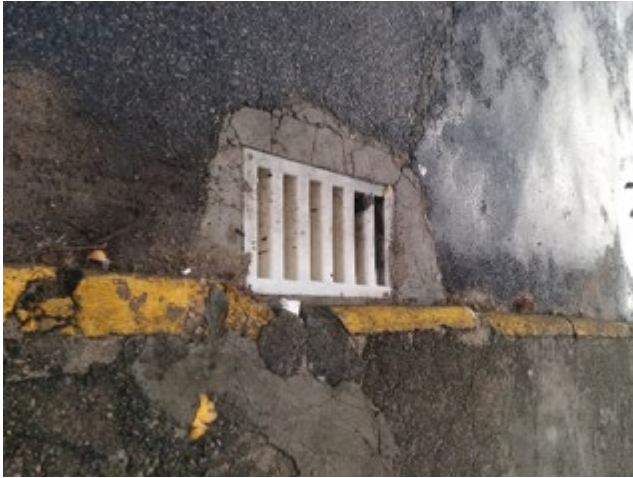
Figure 9 – Drain grate model showing positive affordance for rainwater collection but no negative affordance for trapping bicycle wheels. Rua Altamiro Barcelos Dutra, Florianópolis, Brazil

Therefore, the design of an environment involves creation, modification or elimination of what the environment will afford. Thereby, looking back at the street design approach based on motorized traffic functions in Figure 10, one can see that this interaction with the systems has not been addressed. Consequences of the use of this design approach can be seen in Figure 8. There is not enough room on the sidewalk to place the electricity pole. In addition, manhole lids are placed over the tactile directional floor, and one of these lids is in front of the driveway gate of the building and may break under the weight of the vehicle, which may interrupt passage and cause a distracted or visually impaired person to fall down.