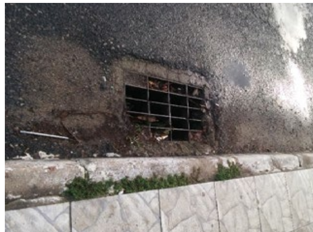
Figure 8 – Drain grate model showing positive affordance for rainwater collection but negative affordance for trapping bicycle wheels. Rua Altamiro Barcelos Dutra, Florianópolis, Brazil

In the same manner, regarding the choice of the elements that shall compose the space, it is necessary to consider how each element may interfere with the functioning of the street as a whole. Comparing the two drain grate models shown in Figure 8 and Figure 9, it can be seen that the first one presents positive affordance relative to rainwater collection (+AAA) at the same time that it presents negative affordance for trapping bicycle wheels (-AUA). The second model presents positive affordance in terms of water collection (+AAA); however it does not show a negative affordance as the previous model did.