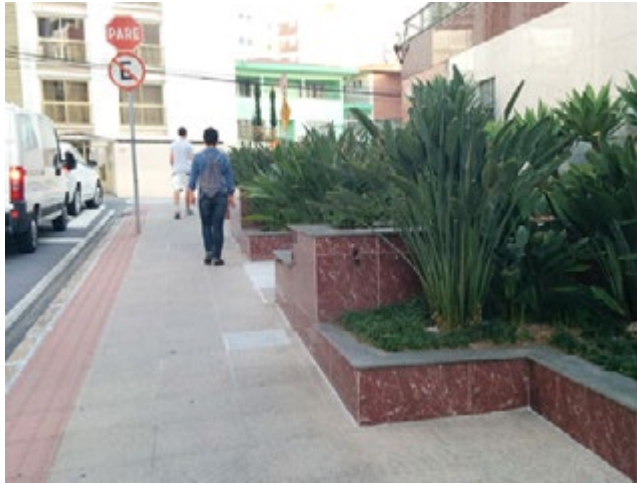
Figure 7 –The affordance of sitting may be present, but people do not necessarily use it.

“The composition of the built environment affords a variety of things to the potential user. It affords visual stimulation and haptic stimulation; it might also provide sonic stimulation and olfactory stimulation. [...] In addition to stimulation as such, the built environment affords many other things that support some behaviors and restrict others. The list is almost endless. [...] The affordances of a particular pattern of the built environment are a property of its layout, of the materials of which it is fabricated, and of the way it is illuminated – with reference, always, to a particular set of people” (Lang, 1987, p. 83).