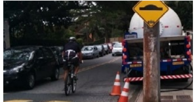
Figure 3 – Butane supply as one of the functions that streets should support. Rodovia João Paulo, Florianópolis.

However, as seen in Figure 3, there is no area for the butane supply truck, resulting in the use of the sidewalk as a load/unload area, which may cause damage to the pavement and manhole lids.