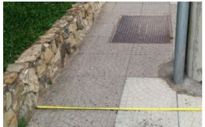
Figure 4 – Sidewalk width of 2,35m resulting in only 1,05m of free space. Rodovia João Paulo, Florianópolis, Brazil.

This lack of relationship between the street design and the different elements and standards that compose the street's tridimensional space results in a defective environment, which is unable to meet the people's needs towards their activities. Recalling that streets are public environments for public use, they have to be designed for all people, and the integration of these elements is of great importance. For example, as can be seen in Figure 4, the full width of the sidewalk is 2,35m; however, considering the electricity pole position, its width drops to only 1,05m, narrower than what is required by the Brazilian Technical Standard 9050/2004 on accessibility.