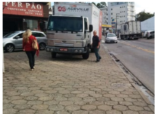
Figure 11 – Lack of load/unload area interferes in other activities in the street. Rua João Piu Duarte Silva, Florianópolis, Brazil.

street usage in different ways. As much as zoning is the same along a street, the same commercial zone can receive different types of businesses. A stationery shop and a grocery store feature various demands in the street space. The grocery store, for example, receives supplies daily in order to have fresh food, but it also has a high product turnover. Thus, the need to load and unload is greater in a grocery shop than in a business that does not have this need of replacing products so often. If the street does not support the needs presented by the use of the buildings, the supply of products either may not be provided or interfere in the performance of other activities, as can be seen in Figure 11.