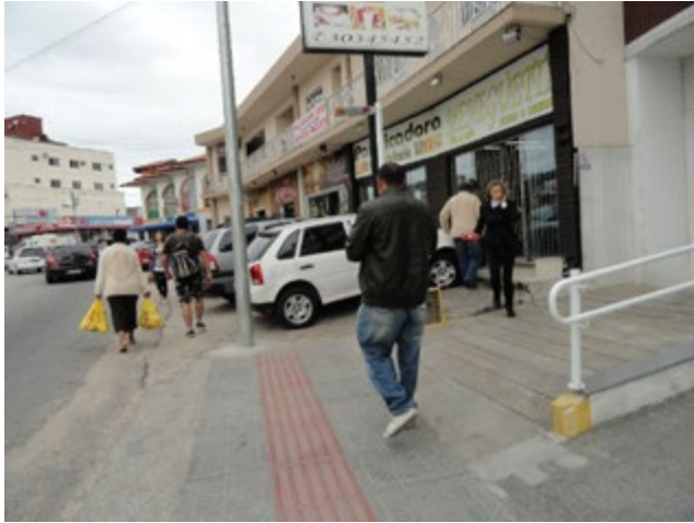
Figure 1 – Car parking as a priority in the use of the sidewalk. Rua Vereador Arthur Mariano, municipality of São José, Brazil.

This concept of design based on a function to rule the configuration of the space is fragile as it disregards other important functions such as accommodation of urban infrastructures. It is noteworthy that, in Brazil, underground power supply and underground communication networks are rarely used. Hence, streets must also be sized to this need. It can be seen, in Figure 2, a cross section of a generic street, standardized by street hierarchy proposed in the Master Plan of the municipality of Biguaçu, Brazil. The street has 75% of its width dedicated to motorized transportation, regardless the size of the power poles, signs and curb. Besides that, land use and population density were also not consider.