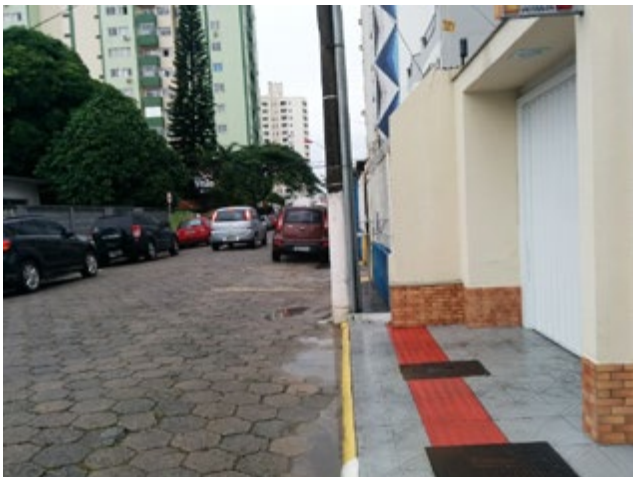
Figure 10 – Interactions between the systems that compose the street must be planned jointly so that the environment can support the different activities assigned to it. Rua Frei Hilário, São José, Brazil.

Therefore, the design of an environment involves creation, modification or elimination of what the environment will afford. Thereby, looking back at the street design approach based on motorized traffic functions in Figure 10, one can see that this interaction with the systems has not been addressed. Consequences of the use of this design approach can be seen in Figure 8. There is not enough room on the sidewalk to place the electricity pole. In addition, manhole lids are placed over the tactile directional floor, and one of these lids is in front of the driveway gate of the building and may break under the weight of the vehicle, which may interrupt passage and cause a distracted or visually impaired person to fall down.