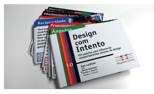
Source: (LOCKTON; HARRISON; STANTON, 2010), translated to Portuguese