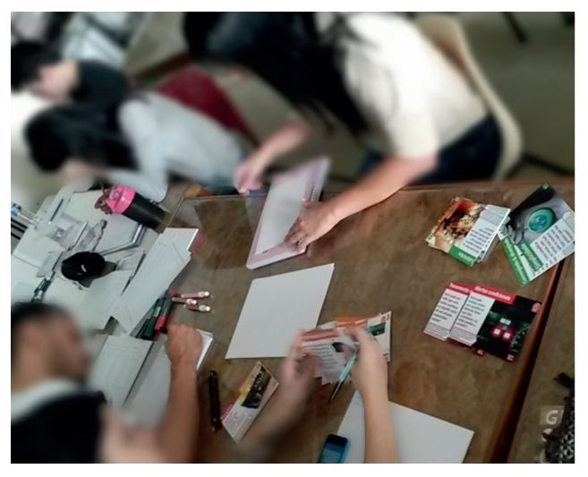
Figure 4 - Example of strategies from one of the groups