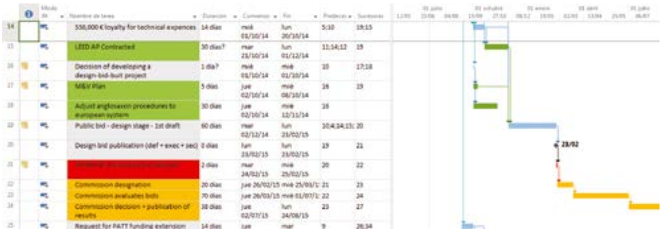
Figure 3 - Snapshot of the project Gantt diagram showing problems (red), problem-related activities (orange), sustainability-related activities (green).